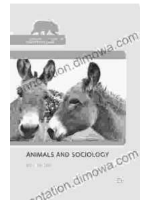
Animals and Sociology: Unraveling the Interwoven Tapestry of Human and Animal Lives