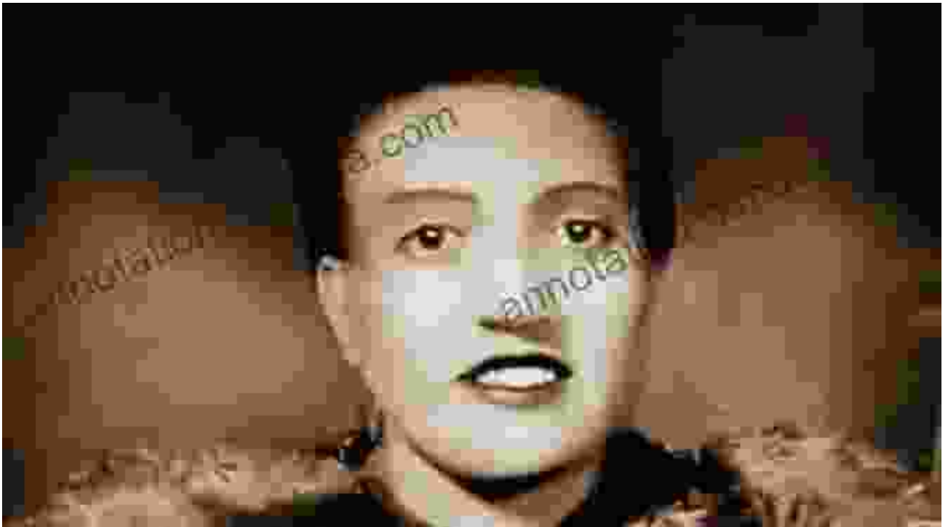
Henrietta Lacks, the "Immortal" Woman

Henrietta Lacks' name may not be widely known, but her contributions to medical science have been profound. In 1951, without her knowledge or consent, cells were taken from her cancerous cervix and used to create the immortal cell line HeLa. These cells have been instrumental in countless medical breakthroughs, including the development of the polio vaccine and cancer treatments.